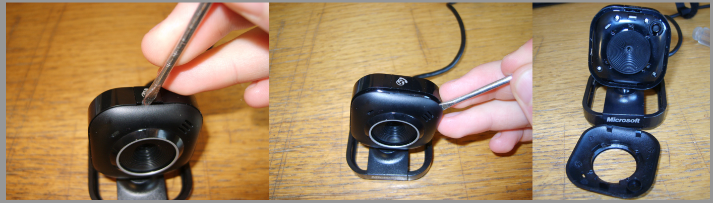
1. Take your 2000 and remove front facia by placing a knife or thin screwdriver in the gap next to the button on the top. Apply a little pressure to pull the front facia off, and work your screwdriver round the facia.

2. Now unscrew the 4 screws on the front of the 2000.